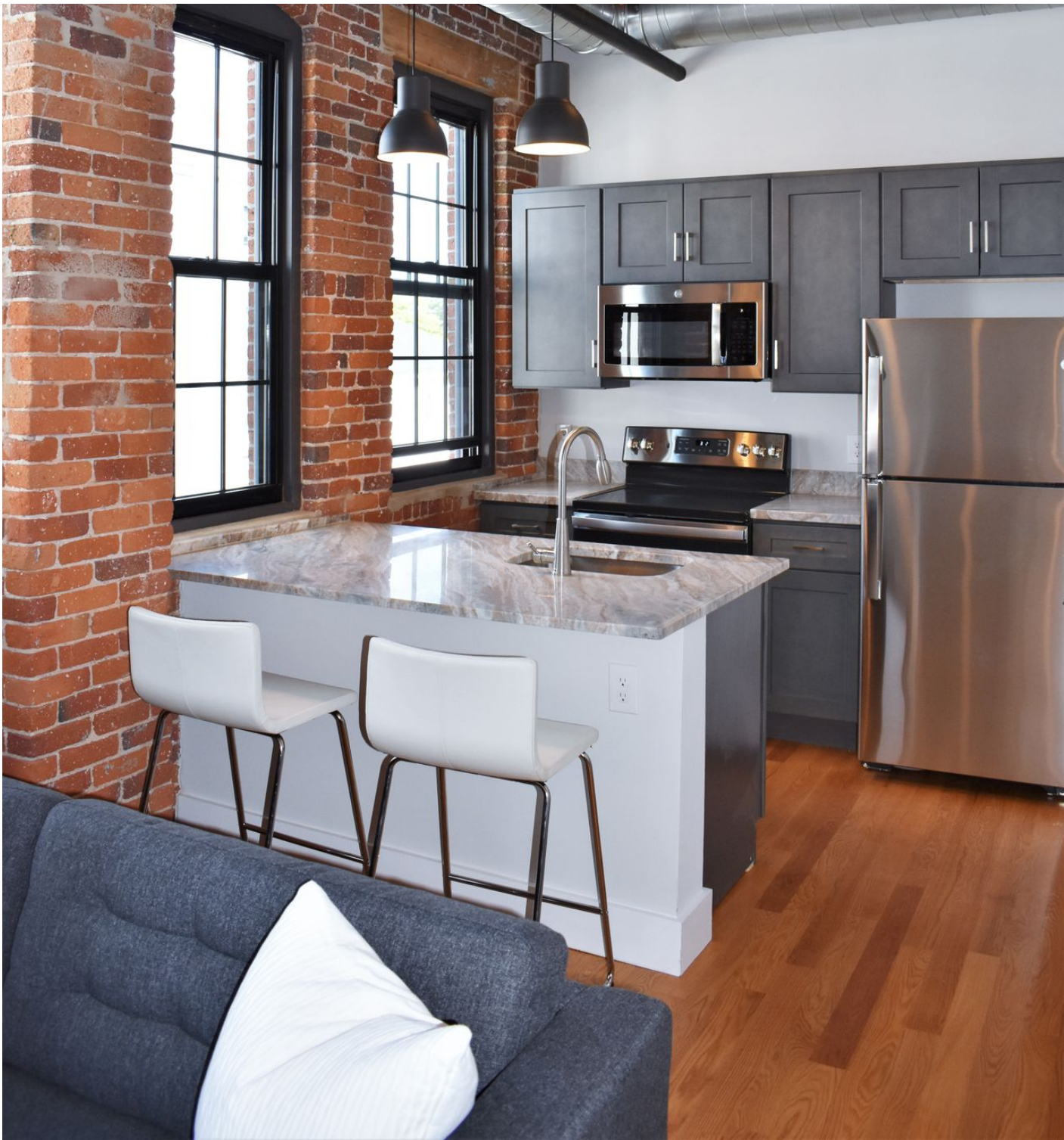
The Torrey Factory Lofts on Chandler Street are set to debut with a ribbon cutting ceremony on Wednesday in Worcester.